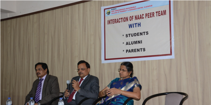
NAAC Peer Team