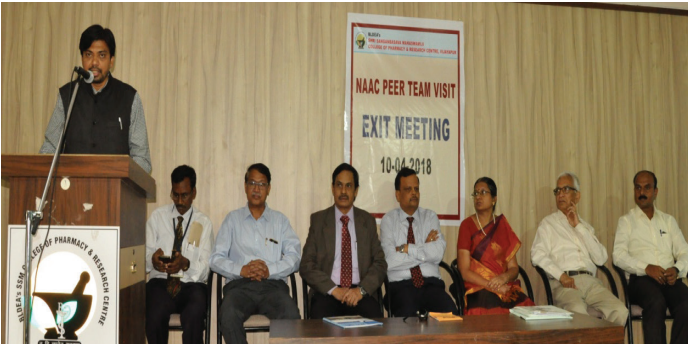
NAAC Peer Team Exit Meeting