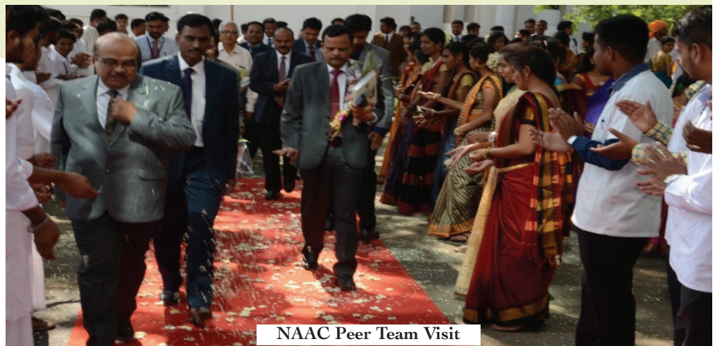
NAAC Peer Team Visit