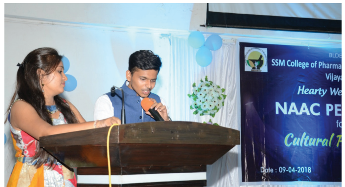
Cultural Programme organised by students for the visiting NAAC Peer Team