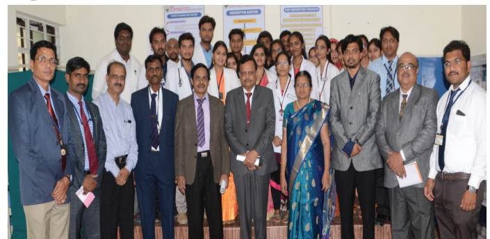
NAAC Peer team Visit @ Pharmacy Practice Department