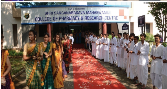
NAAC Peer Team Arrival and Welcome