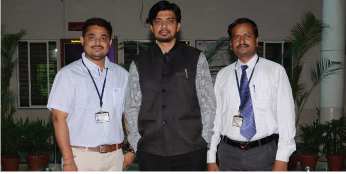
NSS co coordinator, Alumni Association President & Secretary @ NAAC Peer team Interaction