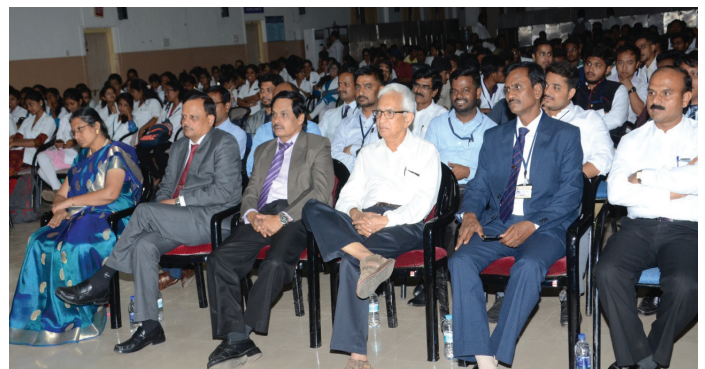
NAAC Peer Team along with dignitaries @ Cultural programme