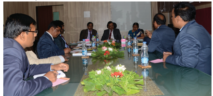
NAAC Peer Team interaction with Institute's Department Heads