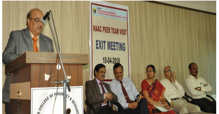
Vote of Thanks proposed by Institute's NAAC steering committee Co coordinator @ Exit Meeting