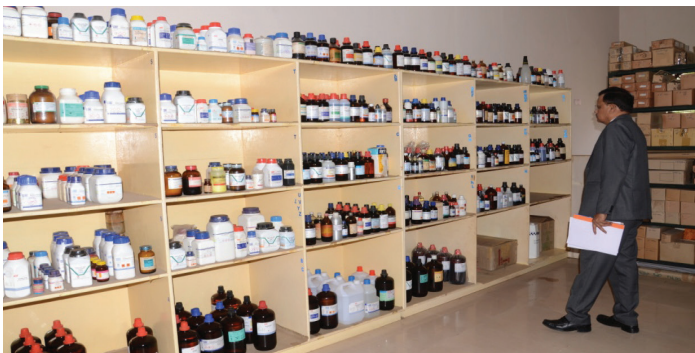
NAAC Peer team visit @ College Chemical Store