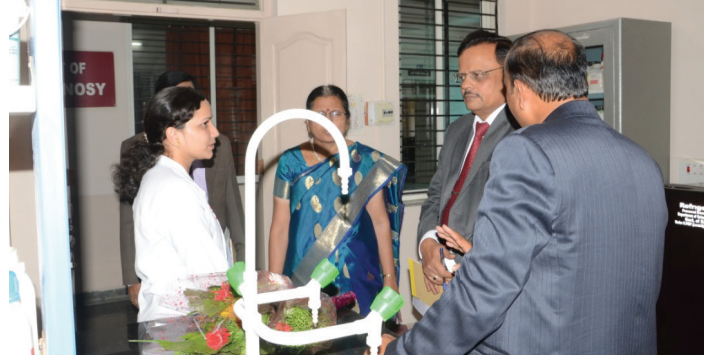
NAAC Peer team visit @ Pharmaceutical Technology Lab