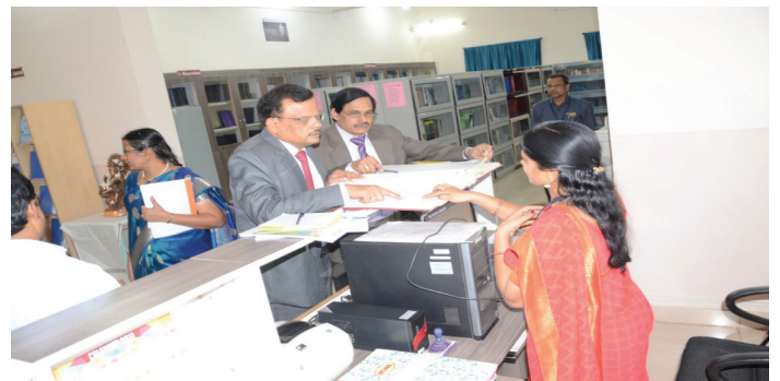
NAAC Peer team visit @ College Library