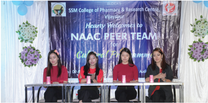
College Students from the North East presenting skit