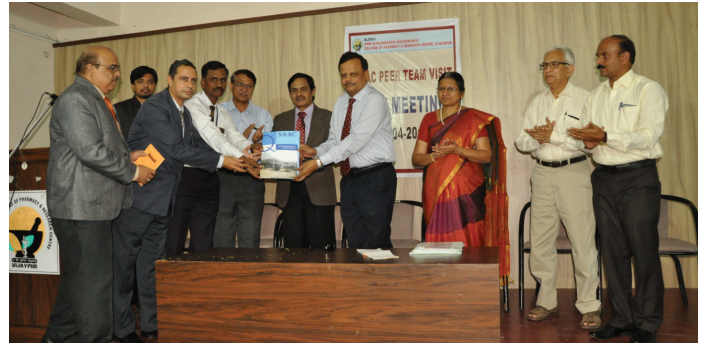
Handing of NAAC Assessment Report to IQAC & NAAC Co coordinator @ Exit Meeting