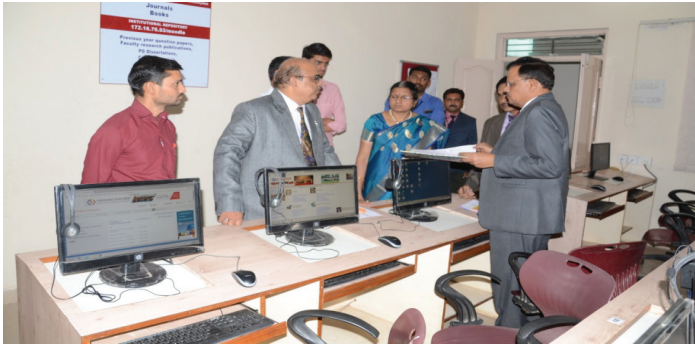
NAAC Peer team visit @ Digital Library