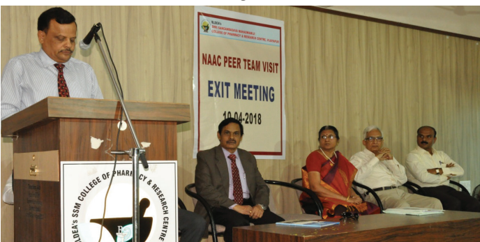
Address by NAAC Peer Team Chairman @ Exit Meeting