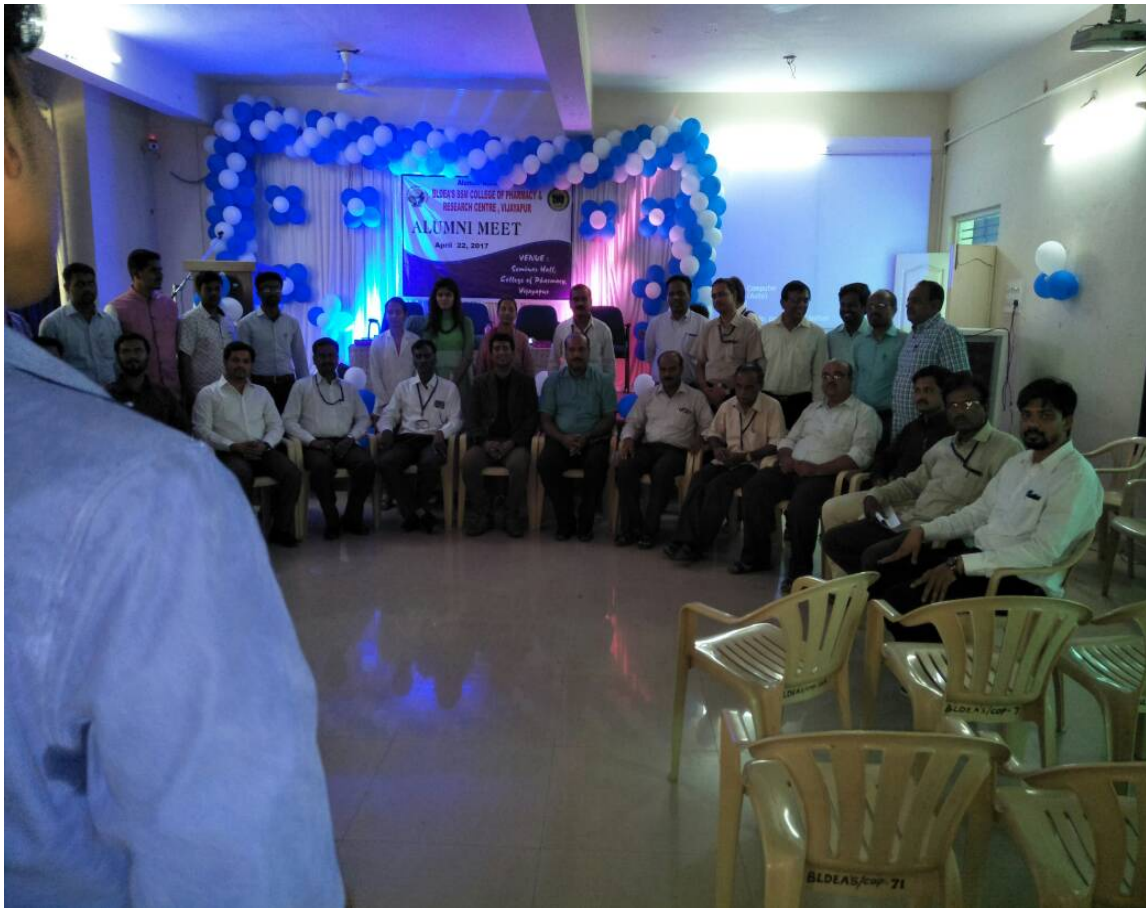
Alumni Meet Memoir