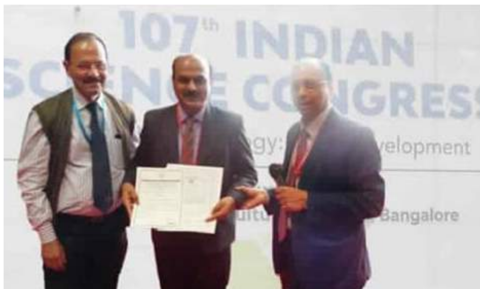
Received prestigious “Prof. Raghottam Rao memorial award 2019” from “Physiological Society of India” at 107th Indian Science Congress, Bangalore for contributions to life science research on 4th Jan. 2020