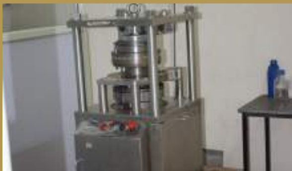
Tablet Punching Machine