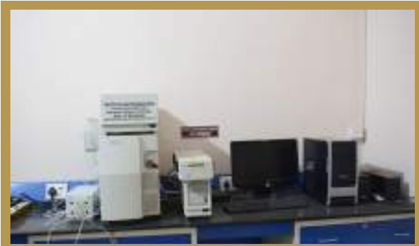
High Performance Liquid Chromatograph