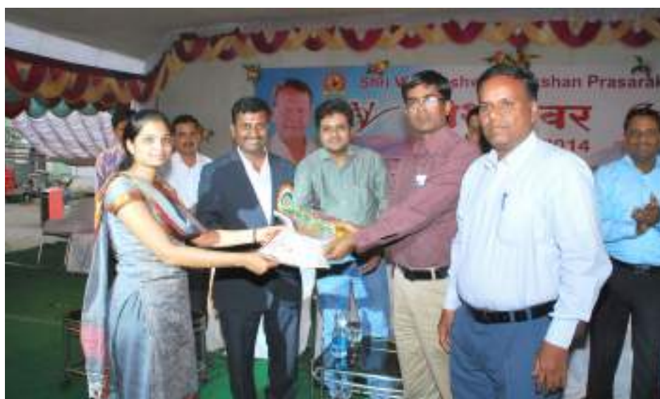
Received best Paper Presentation Award at Shivalingeshwar College of Pharmacy, Alamala, Latur, Maharashtra