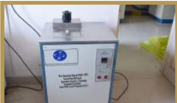
Pre-freezing Glycol Path -40°C