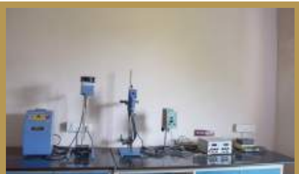
Probe Sonicator , High Speed Homozinizer Brookfield's Viscometer