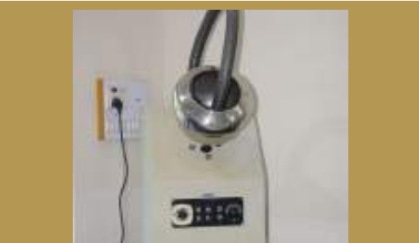
Tablet Coating Pan