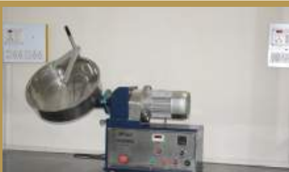
KALWEKA ALL Purpose Machine