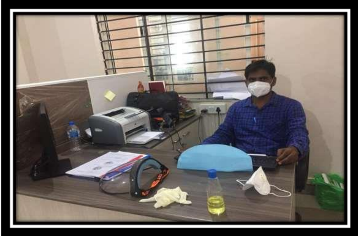
SAFETY KIT (HAND SANITIZER, N-95 MASK, HAND GLOOVES, HEAD CAP & FACE SHIELD) FOR STAFFTS