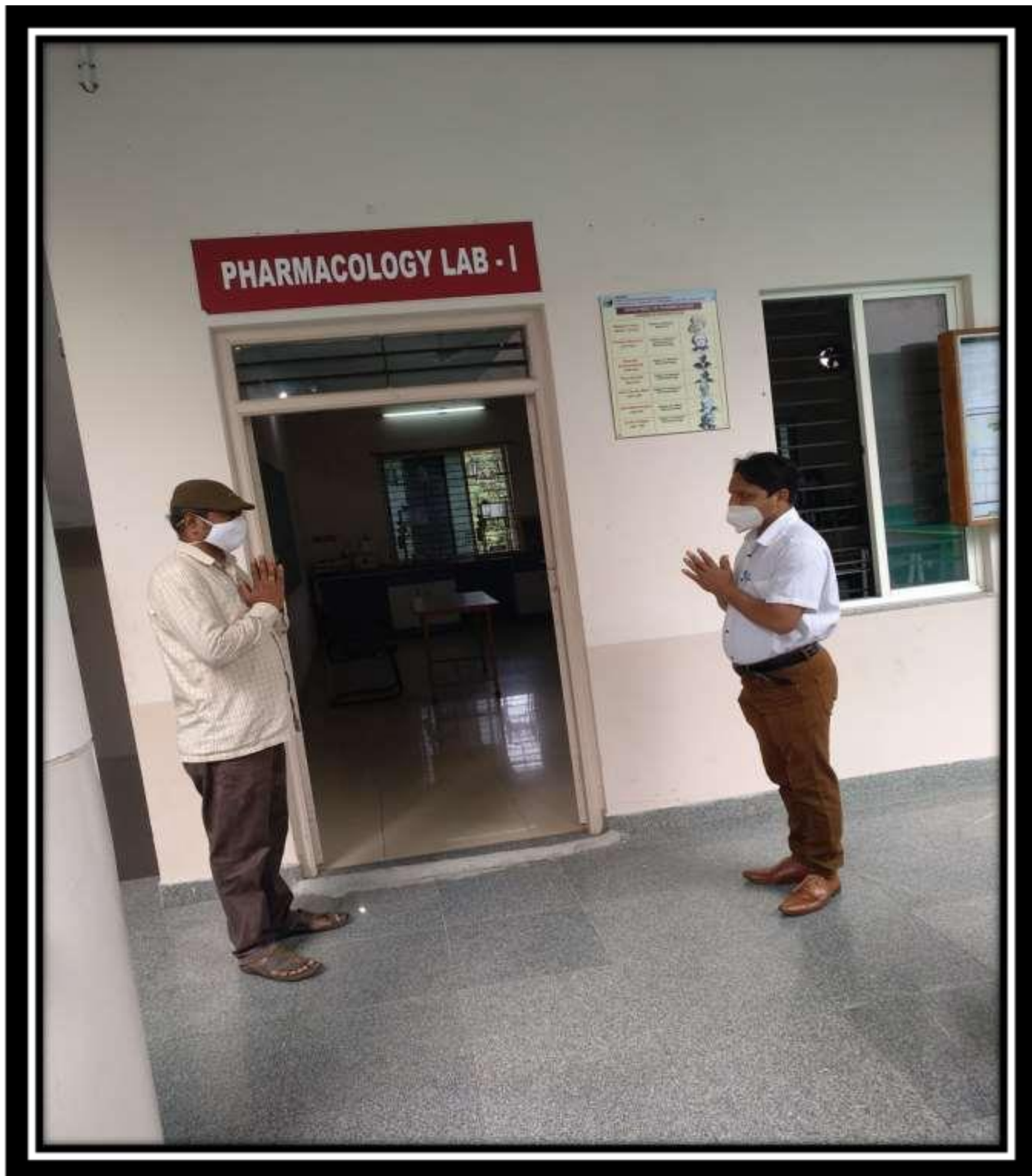
BEST PRACTICE OF NAMASTHE