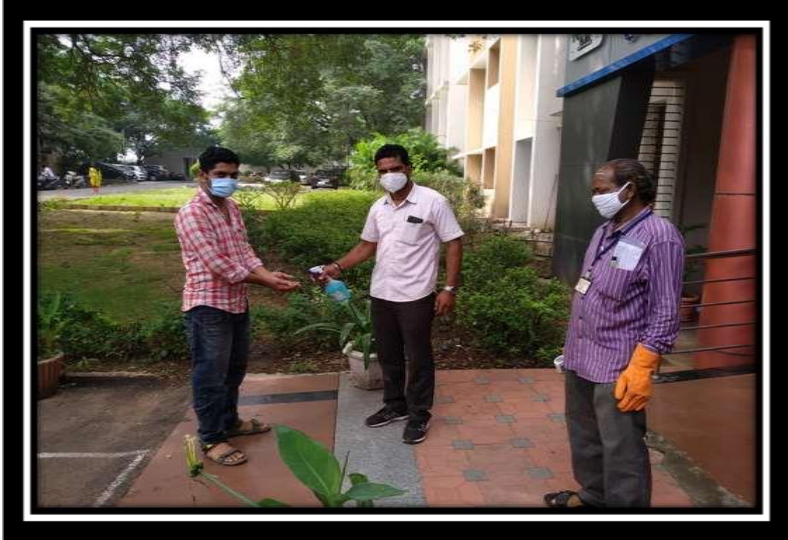
HAND SANITISING AT THE ENTRANCE