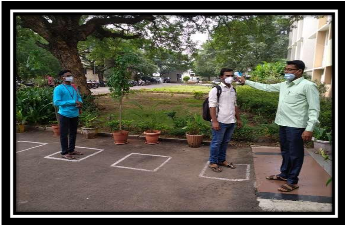
ERMAL SCREENING AT THE ENTRANCE