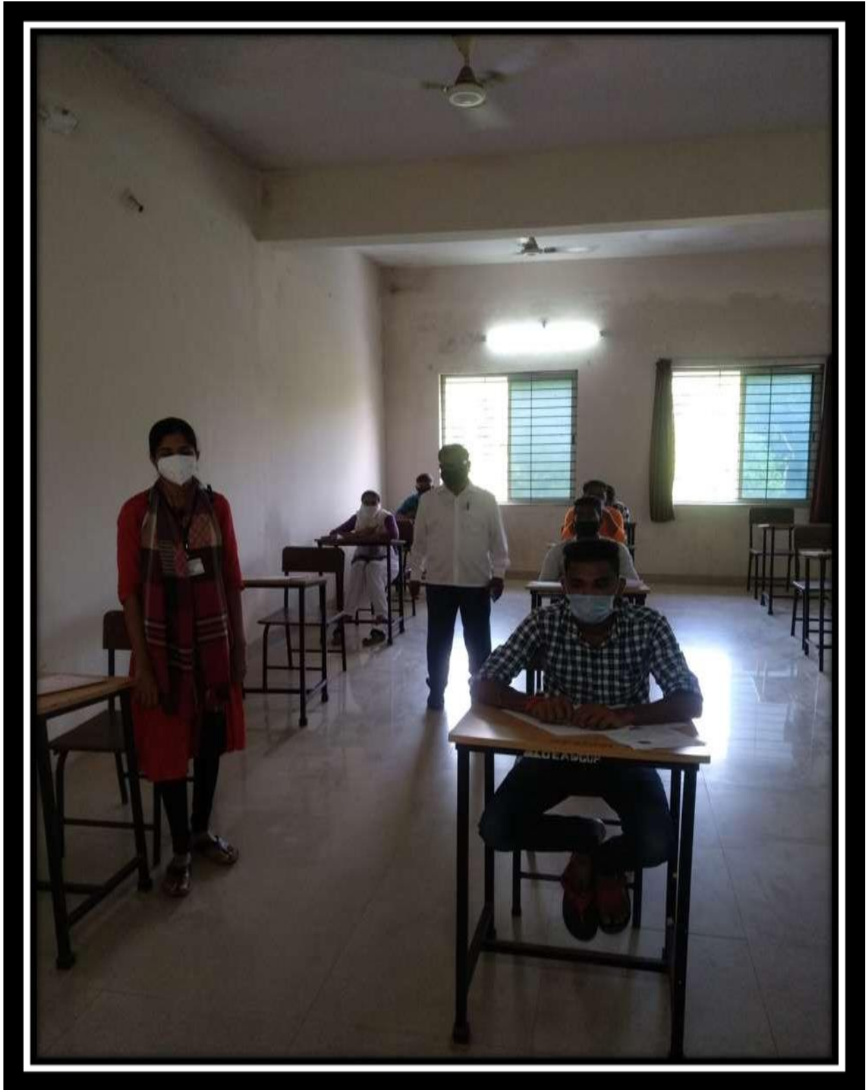
WEARING MASK COMPULSARY BY STAFFS AND STUDENTS