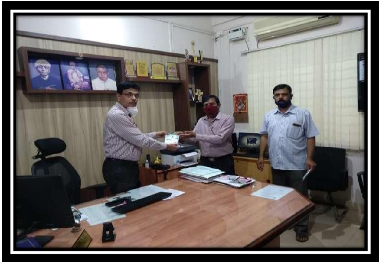
N-95 MASK DISTRIBUTION AMONG STAFF MEMBERS