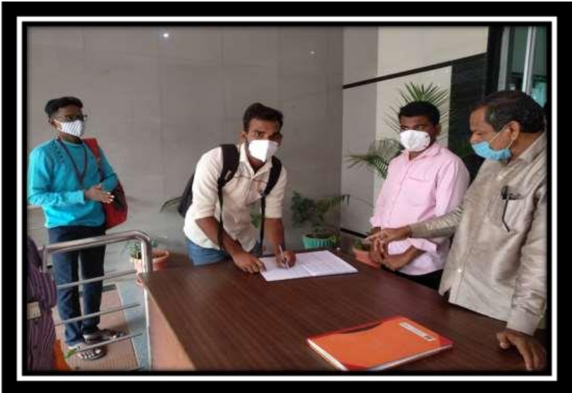
REGISTRATION FOR BODY TEMPARATURE