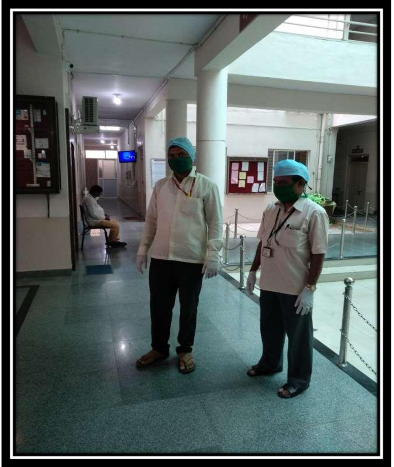
HAND GLOOVES & HEAD CAP UTELIZATION