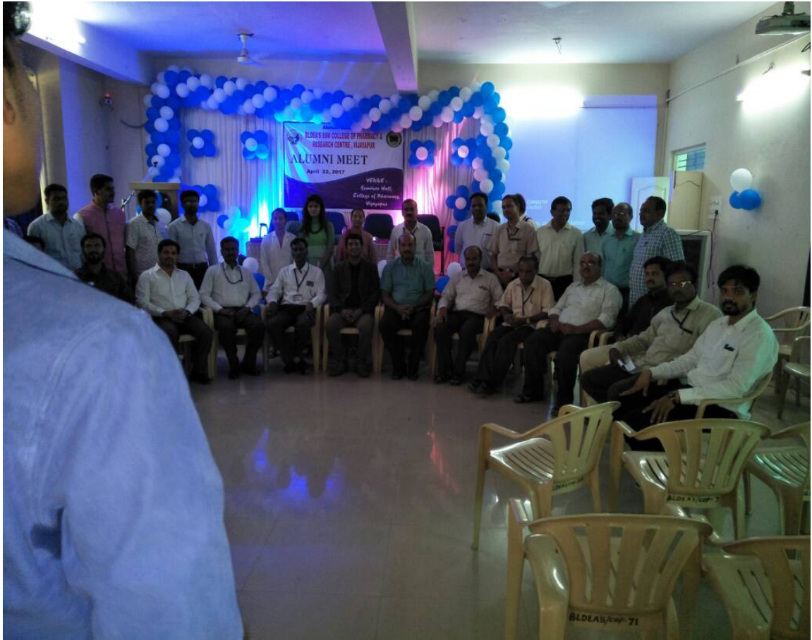
Alumni Meet Memoir