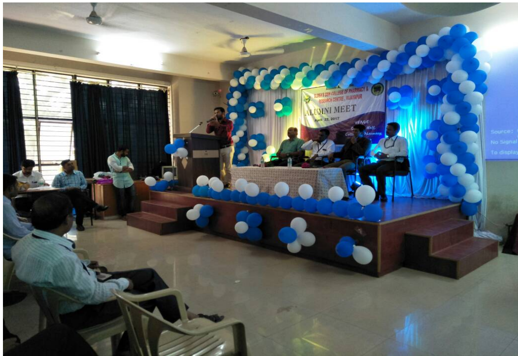
Alumni Meet In Progress