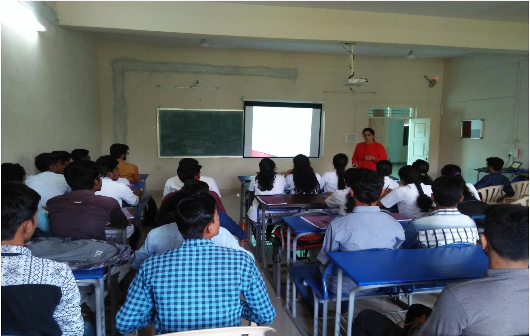
Figure 5 Classroom