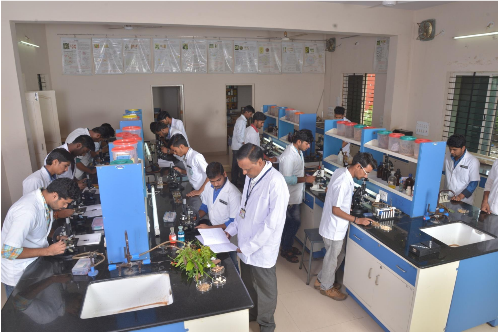
Figure 6 Laboratory