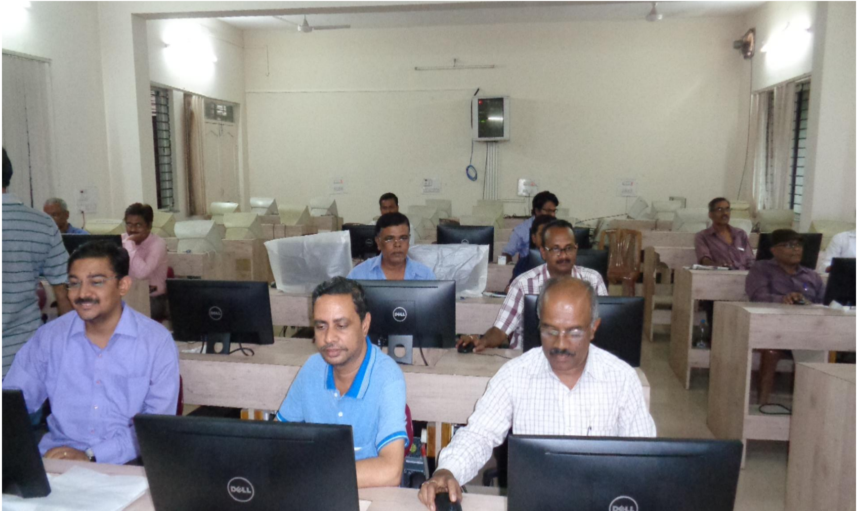
Figure 7 Digital library